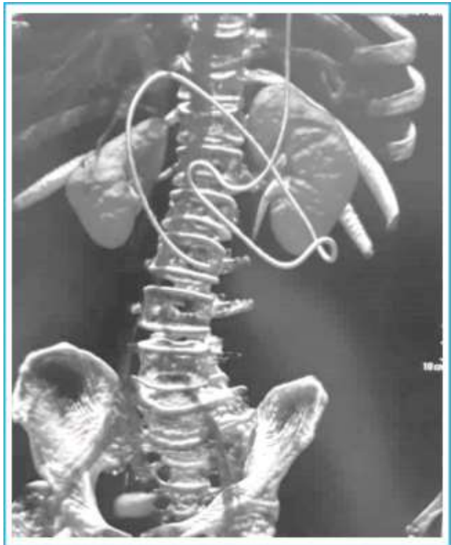
Figure 2: CT scan 3-D reconstruction of the abdomen showing the peritoneal tube of the VP Shunt with no evidence of kinking.